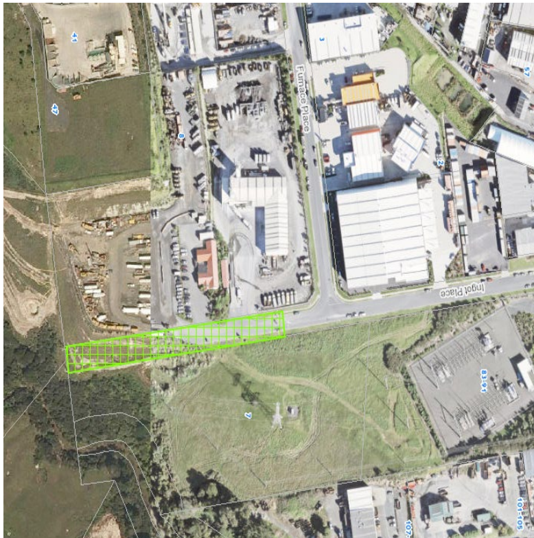
Auckland Council Geomaps