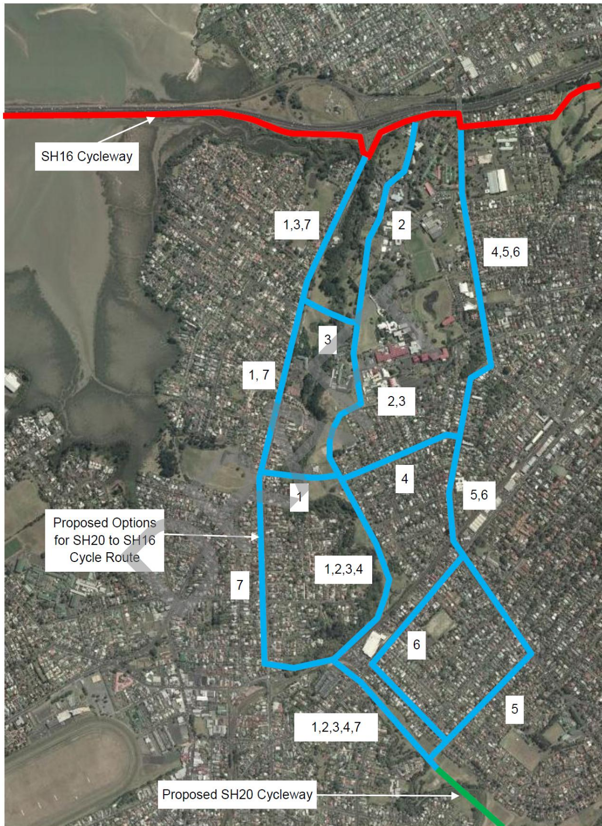
Figure 2-1: Concept Options for SH20 to SH16 Cycle Route