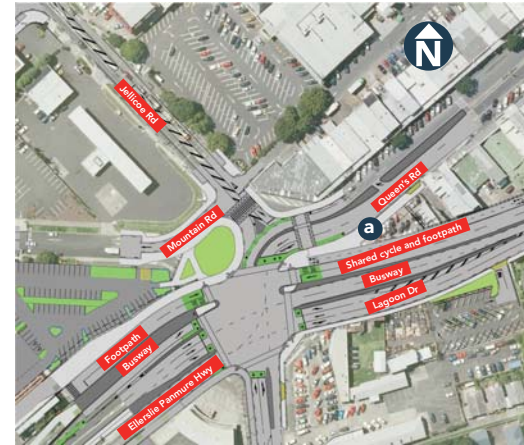
Above: Graphic A - proposed location for Panmure sign is shown by figure a