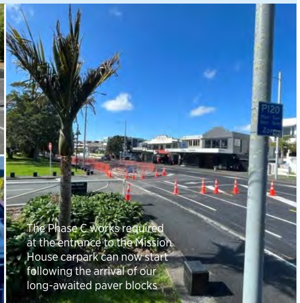
The Phase C works required at the entrance to the Mission House carpark can now start following the arrival of our long-awaited paver blocks