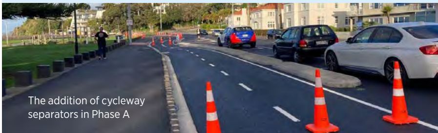
The addition of cycleway separators in Phase A

These cycle separators were manufactured to a specific dimension to allow sufficient width to protect cyclists when doors open suddenly from parked cars. Furthermore, the separators could also be used by pedestrians waiting to cross the cycle lane to access the footpath. However, when pedestrians have to cross the cycle lane, such as when going to and from a bus stop, a pedestrian crossing has been provided due to high pedestrian demand at a specific location.