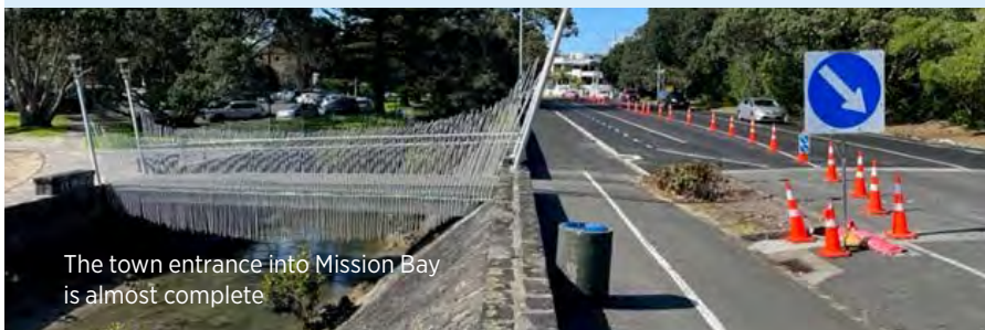
The town entrance into Mission Bay is almost complete

Reduced Speeds in Mission Bay – Existing & Proposed (vimeo.com)