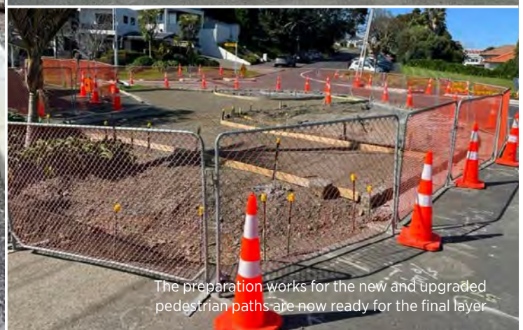
The preparation works for the new and upgraded pedestrian paths are now ready for the final layer