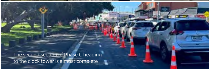
The second section of Phase C heading to the clock tower is almost complete