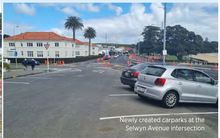
Newly created carparks at the Selwyn Avenue intersection