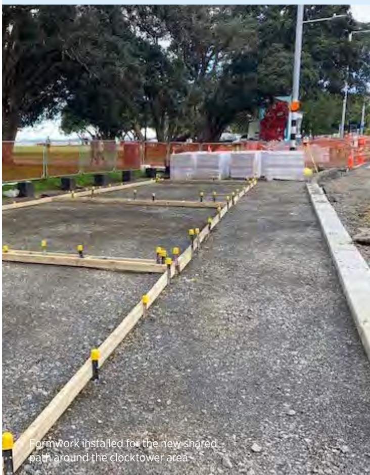
Formwork installed for the new shared path around the clocktower area

With spring in the air and the sun shining, the intersection upgrade at Patteson Avenue and Marau Crescent is now at the point where we are ready to pour the concrete for the safer pedestrian paths and crossing points. We have had to wait for other contractors in the area to complete their work before we can finish this area off.