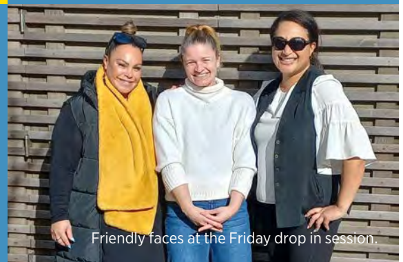
Friendly faces at the Friday drop in session.

We have a drop-in space outside Mövenpick where you can get up to date information about the project or come and chat to us. Auckland Transport and Fulton Hogan project staff will be available at Friday lunchtime to answer your questions and queries about the works (weather dependent). The next drop-in sessions between 1pm-2pm are planned for the 7th, 14th, and 21st of October and there might be one on the 28th, depending on work progress.