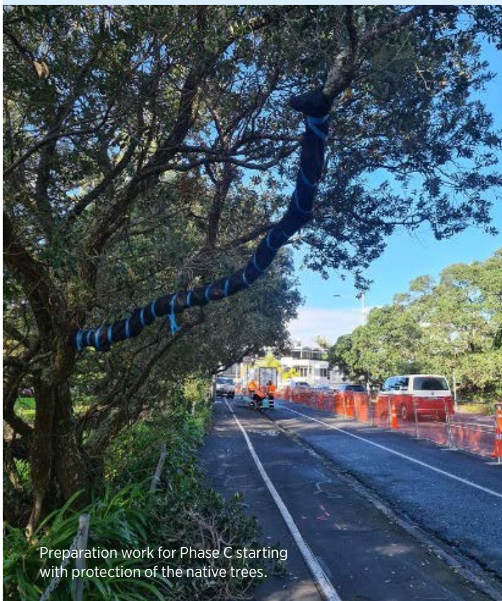
Preparation work for Phase C starting with protection of the native trees.

Most work will be completed during the day (between 7am – 7pm). However, please keep in mind that there are some night works required for resurfacing, line marking and speed tables later in the project, which will take place between 7pm – 5am. We will confirm those dates closer to the time.