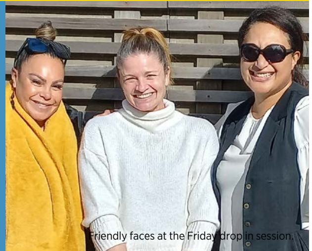
Friendly faces at the Friday drop in session.

Auckland Transport and Fulton Hogan project staff will be available on every second Friday, from 1 July between 1-2pm to answer any questions and queries. Please note that the drop-in session will be weather dependent during the winter months. Come on down – we'd love to chat to you about this project.