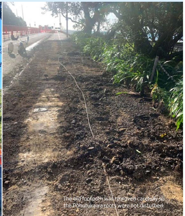
The old footpath was removed carefully so the Pōhutukawa roots were not disturbed.