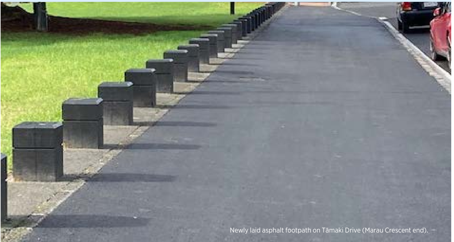
Newly laid asphalt footpath on Tāmaki Drive (Marau Crescent end).

We have now reopened the Phase A section and are now progressing to the next stage of construction. We apologise for any inconvenience the works may cause and thank you in advance for your patience and cooperation.