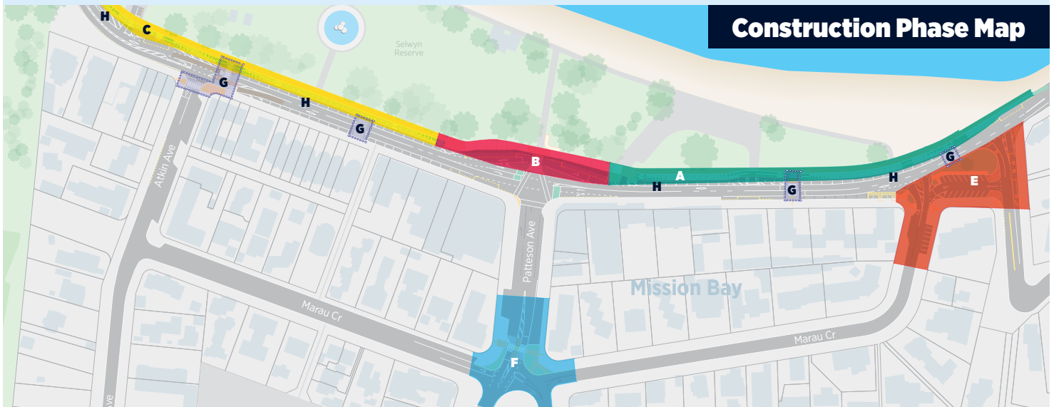
Construction Phase Map