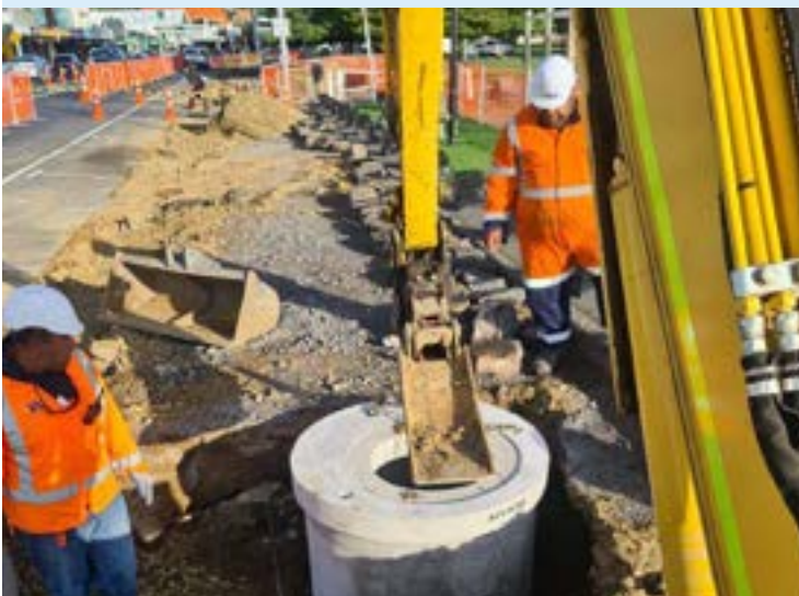
Construction of Phase A work in progress

Most work will be completed during the day (between 7am – 7pm). However, please keep in mind that there are some night works required for resurfacing, line marking and speed tables later in the project, which will take place between 7pm – 5am. We will confirm those dates closer to the time.