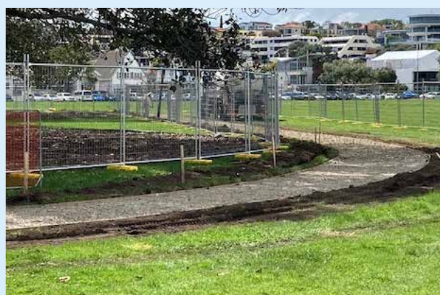
The new, safer path around the Moreton Bay Figs in Vellenoweth Green is taking shape and will be ready for use in early November