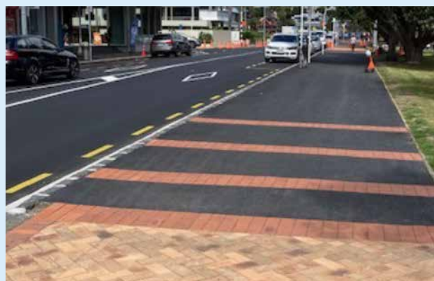
The final result - the new shared pathway and a re-sealed Tamaki Drive

At the same time, we will also be improving the footpath transitions around the speed tables and the pedestrian crossings. The new path is expected to be finished early November.