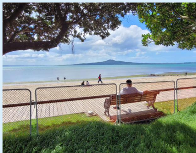
Locals taking advantage of the good weather near the work site

We will begin by removing a section of existing grass ready for the pathway base to be laid with granular material. A permeable surface will then be applied to create the final pathway. Installing the luminaires will be the final step. During this time, we will also be working on the footpath to improve the transitions around the speed tables and pedestrian crossings.