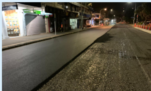
The crew working long into the night resurfacing along Tāmaki Drive