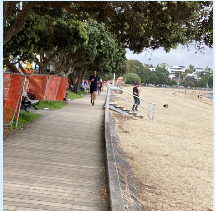
People enjoying St Heliers beach, while work continues on the footpath.