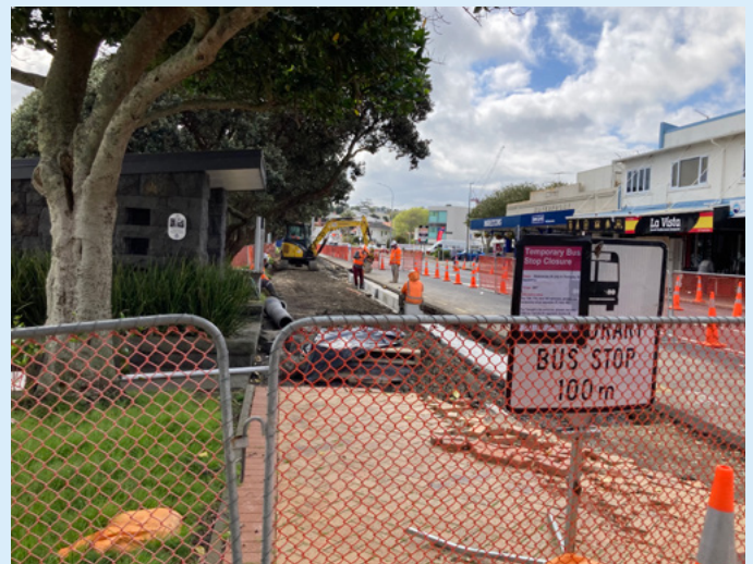
Installation of the heavy-duty Kassel kerbs, being completed by crew following Covid-19 protocols such as physical distancing and wearing face coverings.