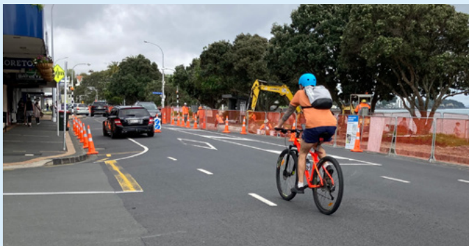
St Heliers has been much busier during Alert Level 3.