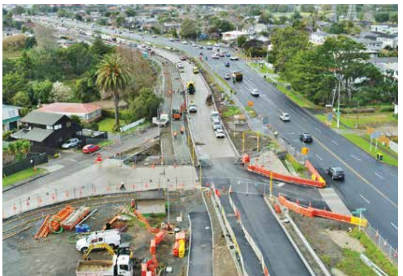
Busway and paths at Kerswill place intersection.