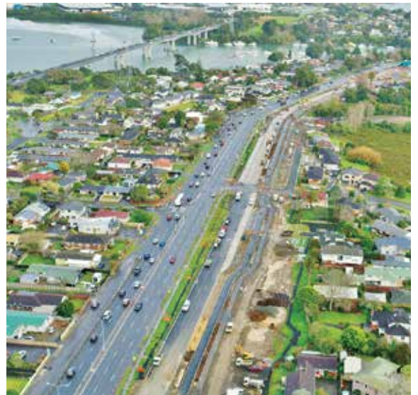
Looking west from Pakuranga Plaza.