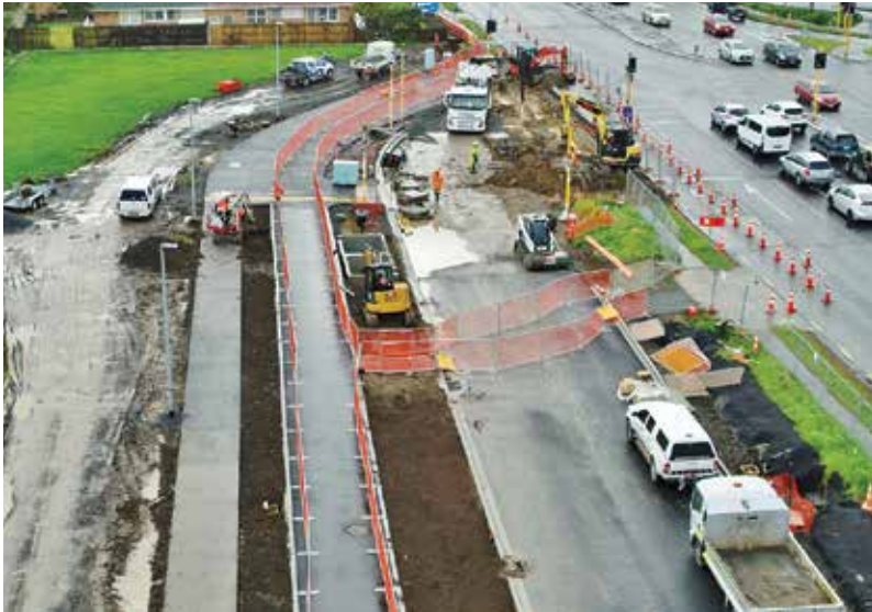
The newly laid footpath and cycle way on the approach to Ti Rakau Drive.