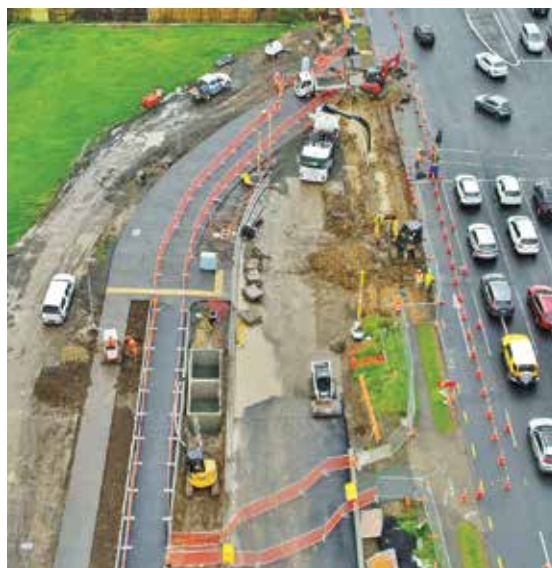
Grass flourishing behind the footpaths and cycleway, tree planting begins soon.