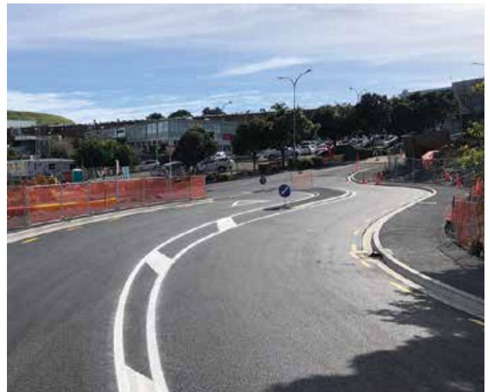
Basin View Lane and Domain Road, as well as Basin View Lane and Lagoon Drive intersections are now paved, line-marked and open.